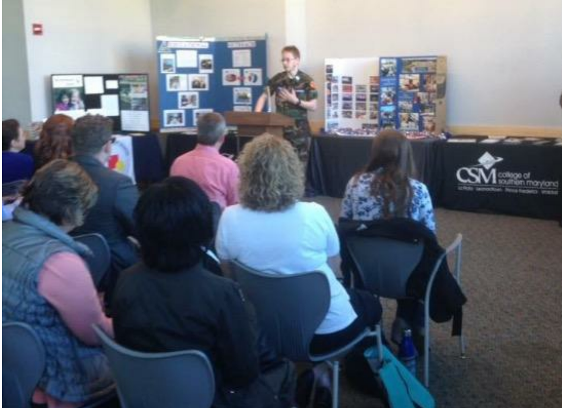
Education Day presentation by the day's youngest presenter - a member of the Civil Air Patrol.